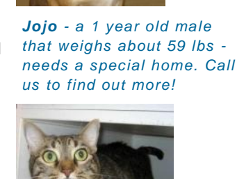
Julie is a 6 year old cat that weighs about 15 lbs.

For other wonderful dogs and cats needing homes, please call