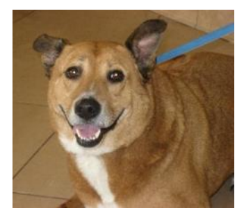
Mabel is about 5 years old and needs a forever home. Call us to get more details!

Maddie is nearly 1 year old. Can you give her a good home?