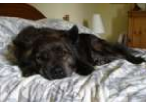
Jenna relaxing before her playtime!

For other wonderful dogs and cats needing homes, please call us at 713-862-7387, or view them on our website at www.hppl.org or go to www.petfinder.com and search for HPPL.