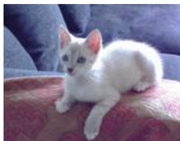
Shanti (~3 months)

Shanti, along with littermates, Ashlin and Rylin, were found as tiny kittens in a back yard. They are now completely ready for the good life. Shanti is a real sweetie who loves playtime with her brothers or just time in a lap being a pampered little girl. This little doll would be a great kitty companion or she would really love a new home with one of her littermates.