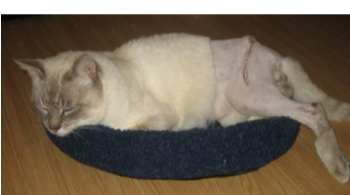
Winsome's first night in foster care!

Donate to help us find more forever homes for pets!