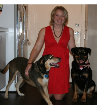
Luckye and Roxie

For other wonderful dogs and cats needing homes, please call us at 713-862-7387 , or view them on our website at www.hppl.org or go to www.petfinder.com and search for HPPL.