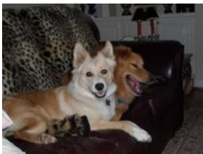
LOXY & HALEY