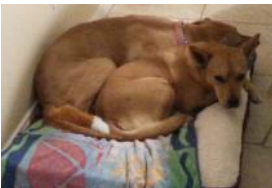
FAWN & FOXY

For other wonderful dogs and cats needing homes, you can call us at 713-862-7387 , view them on our website, or go to www.petfinder.com .