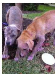
Bonnie & Clyde

As HPPL moves into 2012, we have some "unfinished business" from 2011. First, thanks to your support at the end of 2011, both Bonnie and Clyde are on their way to good health. These two pals were found wandering together in mid December. Both of them rail thin and with bad mange. Poor Bonnie had some terrible facial infections as well. As soon as they were rescued, together, of course, they began their medications and in a few short weeks, they have made remarkable recoveries. Just last week, they were altered and now, the hope is that by the beginning of February, these two wonderfully behaved and very sweet dogs will be ready for adoption. Their foster mom says they have perfect manners and aim to please. Looking at the two of them, you can see that HPPL is busy as the New Year starts!