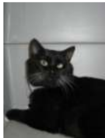
Boots (~2 Years Old)

My name could be Sweetie instead of Boots because I am a real lover of people. My story is pretty grim as I was a stray who was out begging for food and hoping for help. I was constantly being beaten up by other cats (which is why I really don't like them much) because I am such a gentle guy and would never fight back. As a result, I have lost some toes on one paw, am blind in one eye, and have only part of a tail (the other part had to be amputated).