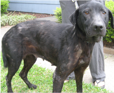
Sabrina First Found

"How is it possible that a dog can be that thin and still be alive?" Those words were the first ones that came to mind when the woman saw the dog. Even at a distance, it was clear that the dog was in bad shape because she was just weaving. Pulling her car over, the kind hearted lady pulled out dog