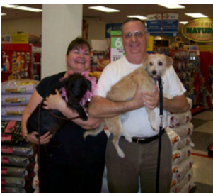
Ellie May on adoption day