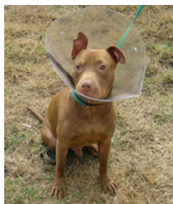
William during recovery

Both dogs were clearly pit bulls, but they needed help. Without any hesitation, when they were called, the dogs immediately came over and into the car they went. A trip to the local veterinarian determined that antibiotics should help with the wound which had been cleaned and treated. At home, came the bath and a comfy bed. Oh yes, and food and oh, how fast the