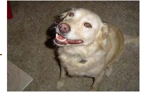
Cleo smiling about her new home