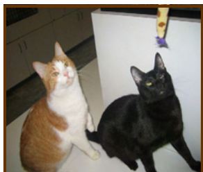
Clockwise from above: Bear, Phoebe, Rocket & Flash

We are the kennel crew: Billy, Phoebe, Bear, Flash and Rocket. Sure it's great being safe off the streets, and we can't tell you how fantastic our caretakers at our kennels are , but come on, it's just not a home. We are here for a variety of reasons and we have been here for varying amounts of time, but the bottom line is We Want OUT! A foster home would be a good start. We could acclimate to being "sprung." Then, be still our hearts, we could have somebody say, "Be mine!" and off we would go to our permanent homes. Sofas and beds definitely have it all over a cage. So do us a big favor and think about fostering or adopting us or spreading the news that we are really, really ready to walk (well, the cats prefer carriers!) out of here. Check us out at www.hppl.org and learn more about our personalities and see how adorable we all are. If we aren't available (yeah!) then ask about another animal who could use your help.