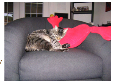
Elmo's got the good life