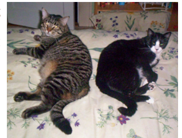
Friskers and his buddy