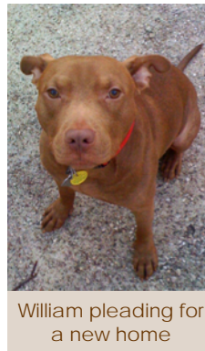
William pleading for a new home

wound would not heal. With one more medical assessment came the determination that surgery was now in the cards...possibly even amputation. The infection was clearly resistant and once the leg was opened up, it became clear that the body was trying to absorb the damaged bone but could not. So the lower part of the bone was removed with no ill effects. With one more course of antibiotics and some "cosmetic" surgery to stretch the skin over the wounded area, William was on the road to recovery.